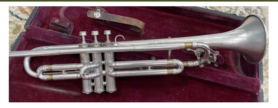
Post-WWII brass with the Continental Colonial name are Pan American stencils. These likely ended in 1955 with the closing of Pan American (below & photos 2& 3 at right).